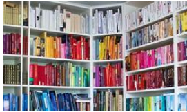
GRAND LIBRARY IN ACA! VISIT IT!