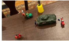
TANKS AND TROOPS ATTACK NEW UNICORN FORTRESS