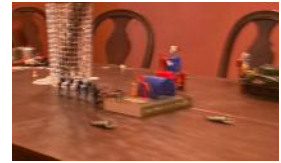
A CANNON FIRING ON NEW UNICORN FORTRESS