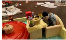
EMPEROR BLUE EYES IS IN HIS CHAIR, WITH SOME ETHANLISH OFFICIALS ON THE DINING ROOM TABLE